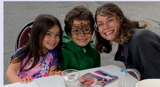
Face painting was part of the Walk fun